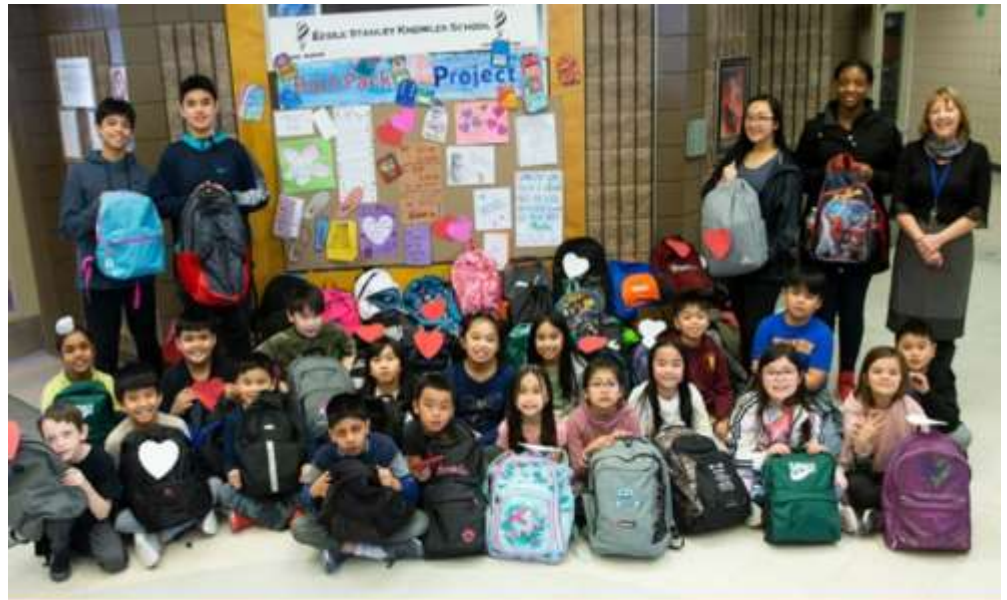
Stanley Knowles students support local homeless

To strengthen and enhance Education for Sustainable Development initiatives that address environment, social and economic issues world-wide.